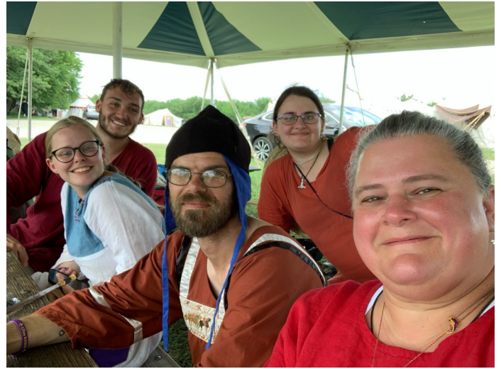
Vatavians watching fightin