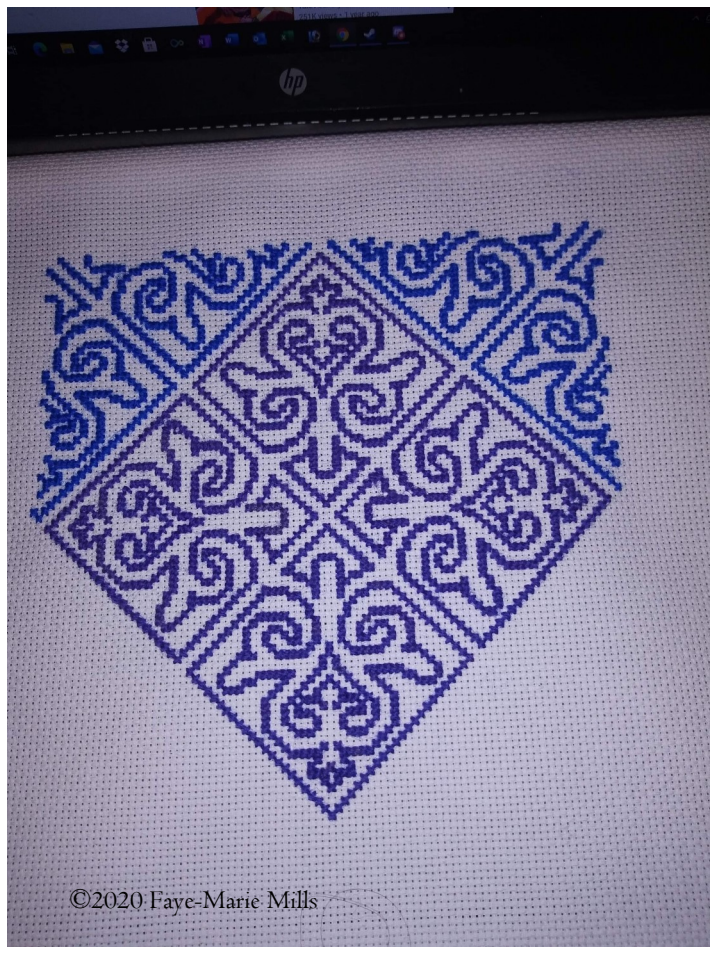
I bought the pattern we used for the presence rug. I liked it so much!

It will be the front of a bag, with dragonfly straps.