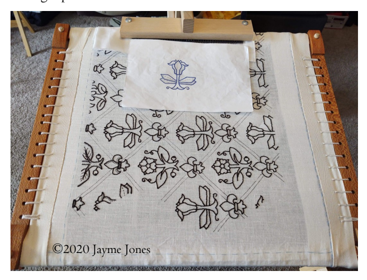
The pattern is based off of the following from the V&A museum:

It's a work in progress of course, but it's the blackwork for a single panel coif.