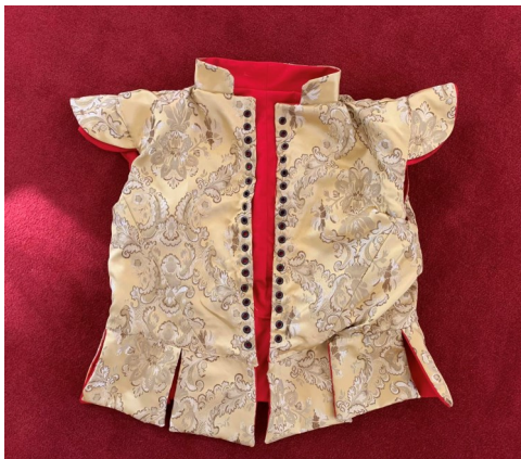
Joachim Courtenay der Marxbruder's Elevation