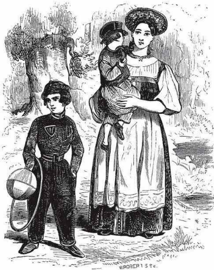
NURSE WITH CHILDREN, IN THE SUMMER GARDEN, ST. PETERSBURG.