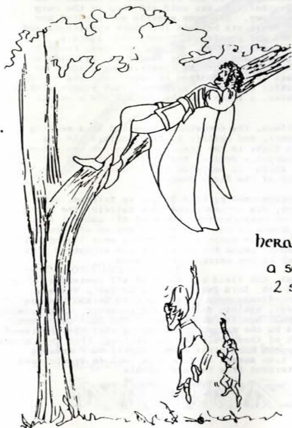
herald's nightmare #5 a squire taunting above 2 smalls saliant frustrated

Dawn was bright and clear. Camps were cleaned, cleared and packed away. Hugs, well wishes, and farewells abounded. Many travelers began their treks toward home. As the Greymoor Warwagon pulled out of the site, we knew that the folk were satisfied that the future of the realm was in good hands.