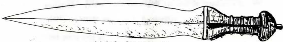
Celtic Leaf-bladed Sword

Clouds gather grey in the skies; I hear the drums in the distance; The sounds roll across the hills with the mists. The gods play war as a game of chance I hear the Warrior's cry. The smell of anxious horses and muscled warriors wrapped in leather and metal, Bowmen ready arrows on taugt sinew and bone behind a shieldwall; We are ready for battle And I hear the Warrior's Cry. With my shield on my left arm and blade in my right hand my heart pounds in my chest and I am ready; Our King calls us to defend our comrades land. I hear the Warrior's Cry. Bound by chains of Honor and an oath of Loyalty, standing by our banner under our Falcon's wing. Proudly living our fealty: I hear the Warrior's Cry.