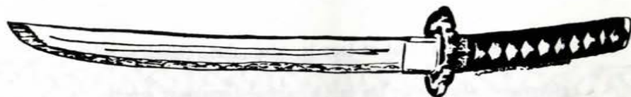
Samurai Katana (Museum Ref: 2546)